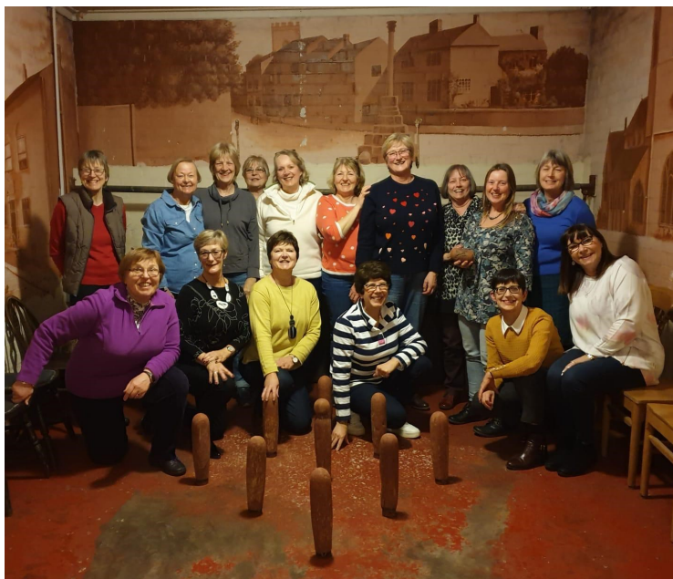
Breedon on the Hill won the Federation Skittles Competition and Ashby Spa were runners up